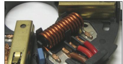
Terminal connections for sensors