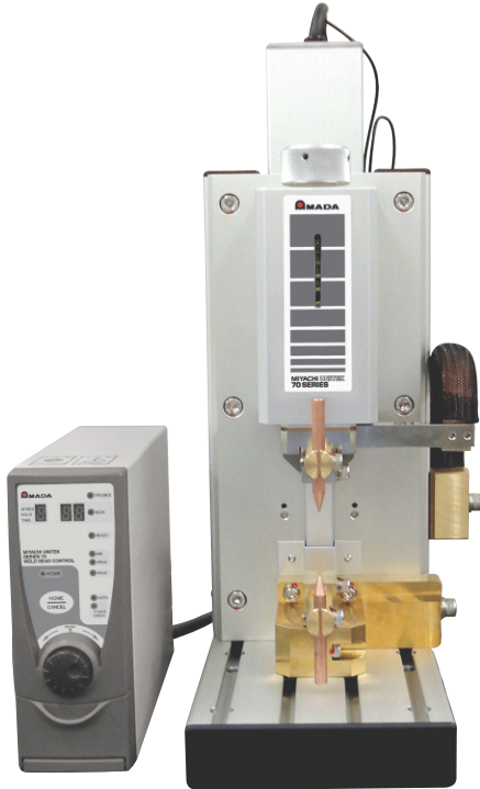
73 opposed weld head