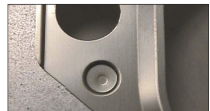
Joining of stamped sub-assemblies