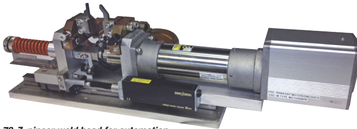
73-Z, pincer weld head for automation

Designed for use in automation or benchtop welding, Amada Miyachi's Model 73 and Model 73-Z weld heads offer fast, repeatable electrode motion control for a wide range of resistance welding applications. The Model 73 weld head is an easy-to-program, state-of-the-art servo motor controller that allows precise programming of electrode position and speed for up to 31 different weld schedules. The 73-Z pincer weld head has self centering electrode clamping and floating mechanism to ensure the part is centered between the electrodes every time.